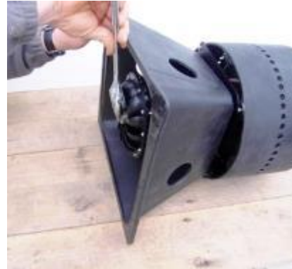
Turbine still fully operational