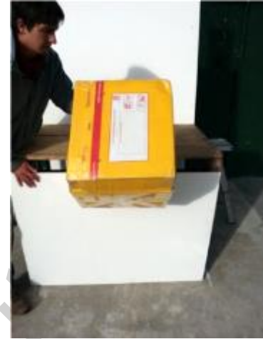
Drop test 3