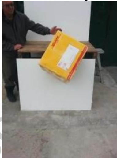
Drop test 2