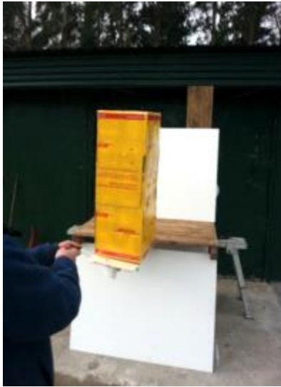
Drop test 1