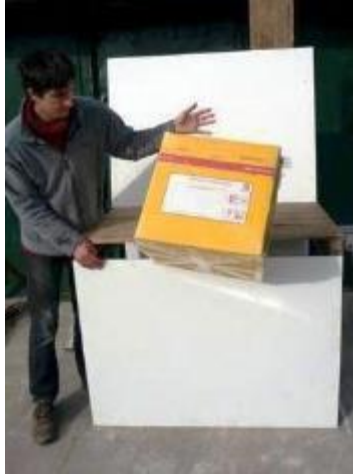
Drop test 1

The PLT package was dropped (from 1m on to concrete) on different faces and edges to evaluate its resistance to transit drop damage.