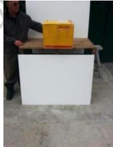
Drop test 3