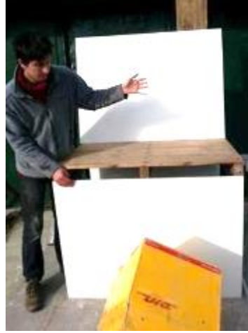
Drop test 2