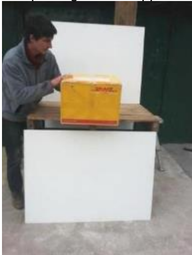
Drop test 1

The package was dropped on different faces and edges to evaluate its resistance.