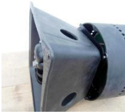
Slightly damaged corner

once bolted down to a base it will straighten. The turbine was still rotating and fully functional.