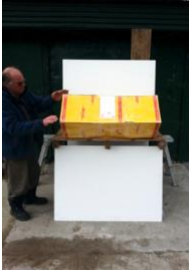
Drop test 2