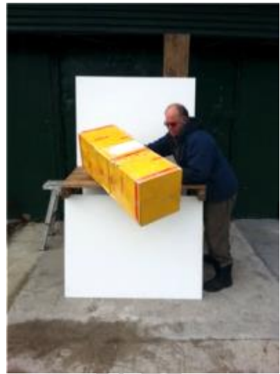
Drop test 3